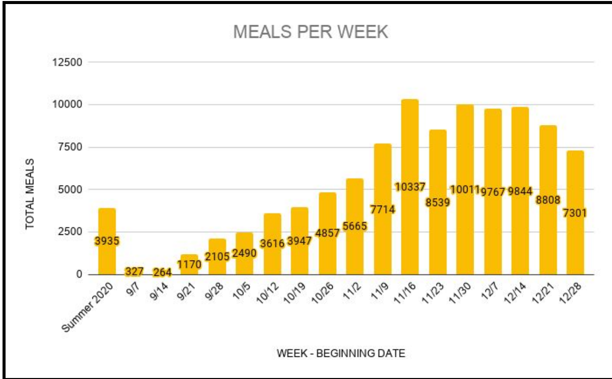
Figure 2. Meals distributed per week throughout Everyone Eats program in Chittenden, Franklin, and Grand Isle counties in 2020.